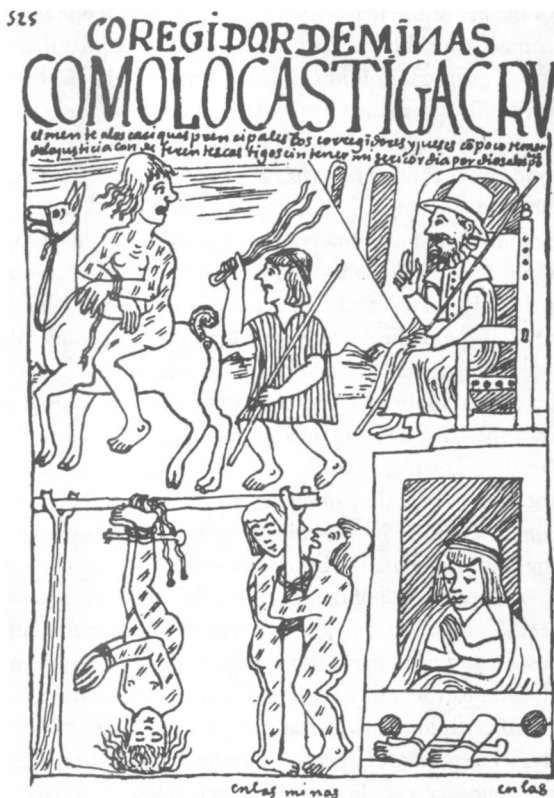
Fig. 3. Corregidor de minas. Catalog of Spanish abuses of indigenous labor force.