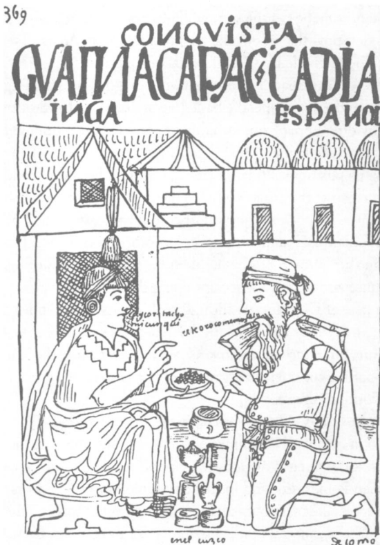
Fig. 2. Conquista. Meeting of Spaniard and Inca. The Inca says in Quechua, "You eat this gold?" Spaniard replies in Spanish, "We eat this gold."

The second half of the epistle continues the critique. It is titled Buen gobierno y justicia 'Good Government and Justice' and combines a description of colonial society in the Andean region with a passionate denunciation of Spanish exploitation and abuse. (These, at the time he was writing, were decimating the population of the Andes at a genocidal rate. In fact, the potential loss of the labor force became a main cause for reform of the system.) Guaman Poma's most implacable hostility is invoked by